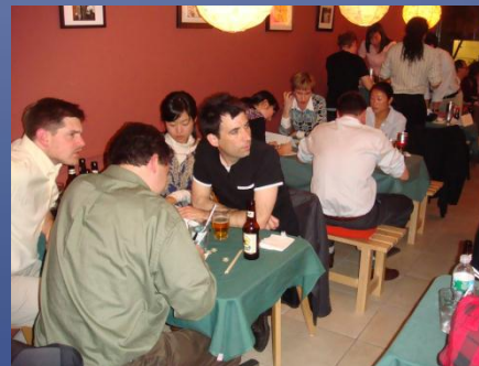
Izakaya Pub Quiz