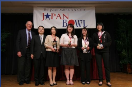
National Japan Bowl

Is a 501 (c) (3) nonprofit, nonpartisan educational and cultural organization for individuals and corporations with an interest in Japan and US-Japan relations. The Society promotes greater understanding and networking between Americans and Japanese through its many cultural, public affairs, and educational programs.