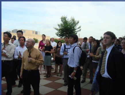
Beer Garden Party